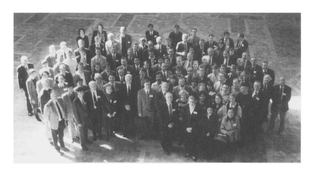
Reception at City Hall